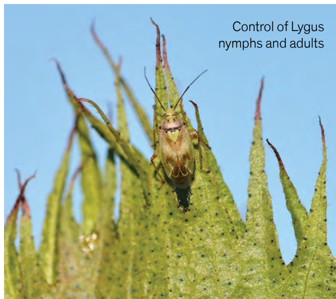
Control of Lygus nymphs and adults