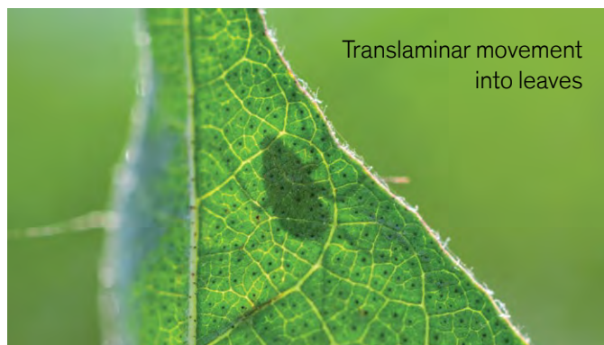
Translaminar movement into leaves

DuPont™ Vydate® C-LV insecticide/nematicide